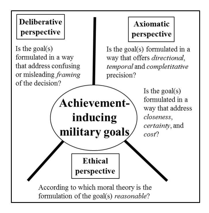
Figure 1: A guideline (a planning tool) when conducting goal-management within operations planning.

Figure 1 visualizes our suggestion on a framework/guideline for managing the methodological challenge of conducting goal-management within operations planning.<sup>11</sup>