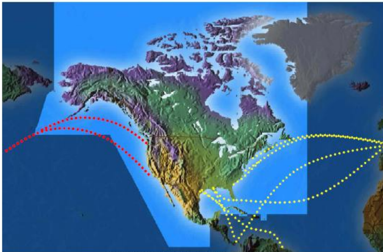
Figure 1 – Great circle routes