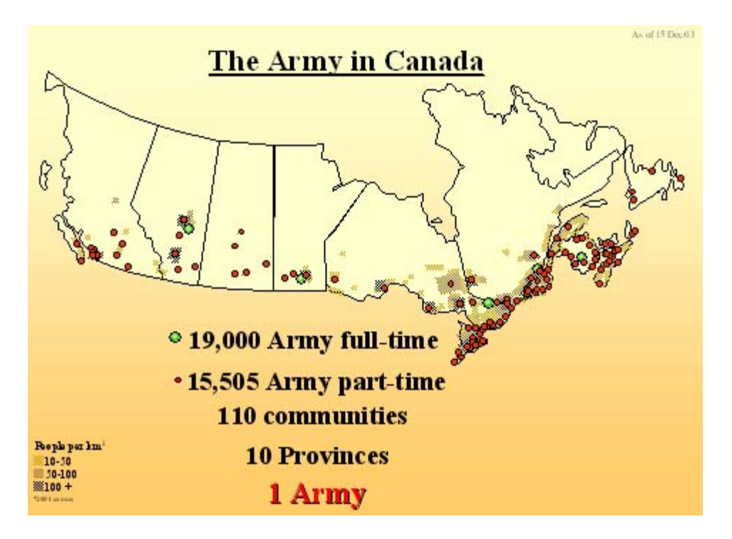
FIGURE 1-THE ARMY IN CANADA (USED WITH PERMISSION)