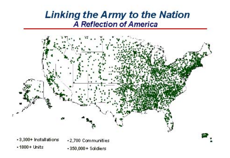
FIGURE 2-THE NATIONAL GUARD IN US COMMUNITIES (USED WITH PERMISSION)